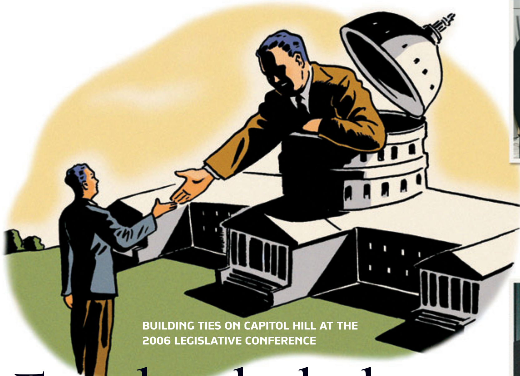
BUILDING TIES ON CAPITOL HILL AT THE 2006 LEGISLATIVE CONFERENCE