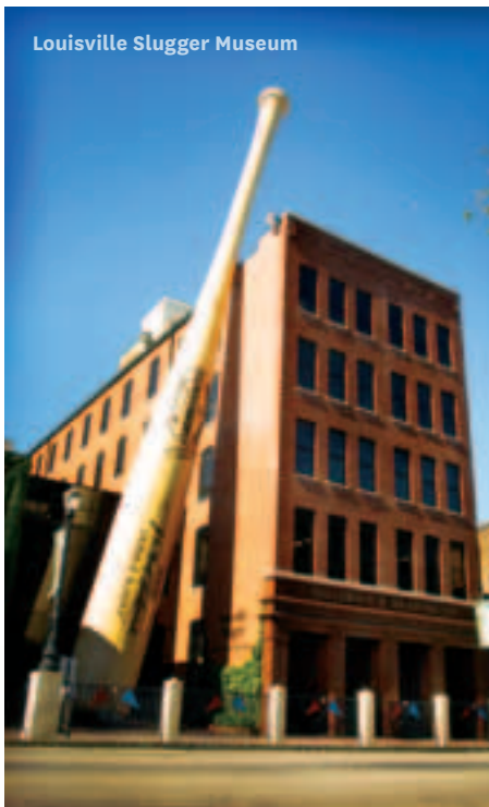
Louisville Slugger Museum

APRO's host hotel is the beautiful Marriott Louisville Downtown, which is connected by a skywalk to the Kentucky International Convention Center, the site of APRO's 2010 Trade Show. Located in the heart of downtown Louisville, the Marriott is within walking distance to several of the city's major attractions, including the Fourth Street Live entertainment complex, Museum Row—which includes the Louisville Slugger Museum, Muhammad Ali Center, Frazier International History Museum, Glassworks and the Kentucky Center for the Performing Arts—and the banks of the Ohio River.